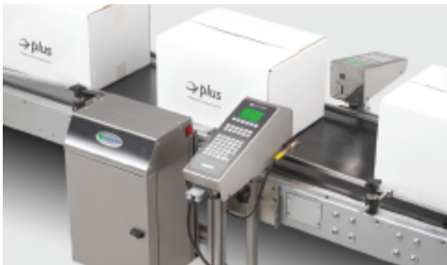
The C-Series plus part of the Domino plus programme