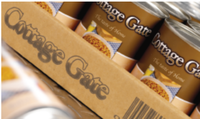
Remote head variants for low level tray coding