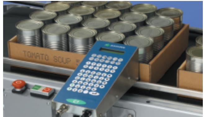
The C-Series standard alphanumeric coder