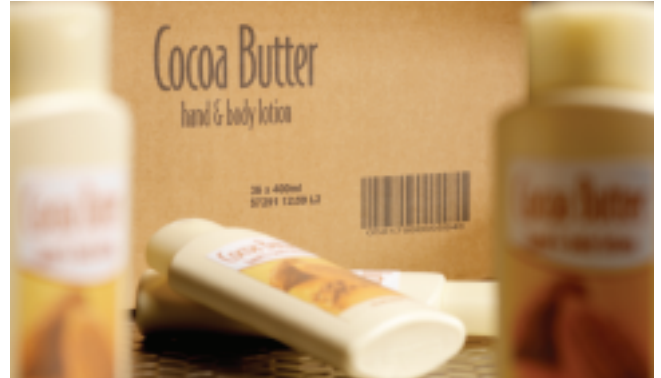
Multi-head C-Series plus on blank outer cases