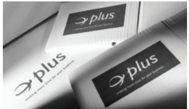
High quality text and graphics capability